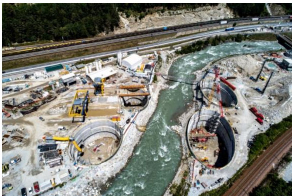
2 Ground freezing was vital for the Isarco River underpass