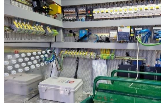
Communication room of disc cutter wear sensor system, South Korea