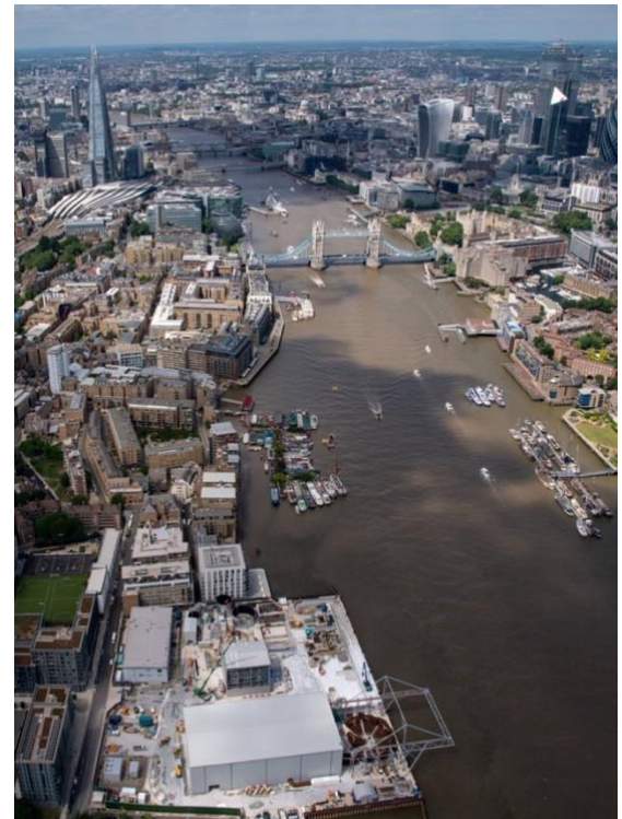
Riverside construction site of Major Project Award Winner, Thames Tideway in London, UK